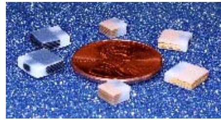
Figure 1. Solid State Sensor Elements (patent pending). These sensors offer outstanding performance at low and high humidity in a small, rugged package, ideal for surface mount integration with related electronic components