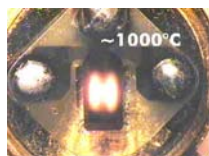
Element heated to 1000°C