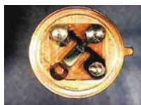
Mounted sensor element

Microsensor elements can be mounted in a variety of ways; currently, they are most commonly packaged on TO-39 headers as shown below. The thermally isolated area can be heated to up to 1000°C without damage, and has a demonstrated lifetime exceeding 10 5 cycles.